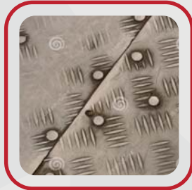
Aluminium Chequered Sheet