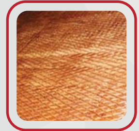
Wooden Chequered Sheet