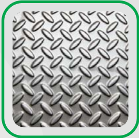
Stainless Steel Chequered Sheet