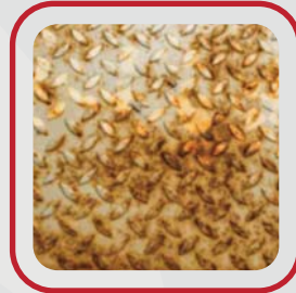
Mild Steel Chequered Sheet